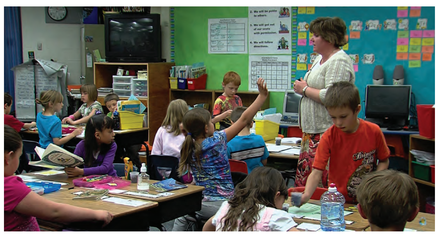
A classroom playing the Good Behavior Game in Denver.

some of these problems later in the life course;